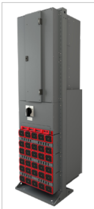
BPC Inverter System