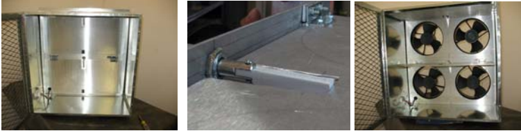
Positive shut off doors closed

To reset, Open the Positive Shut off System switch. Remove the front screen. Lift the doors up. Reset the latches. Then close the front screen.