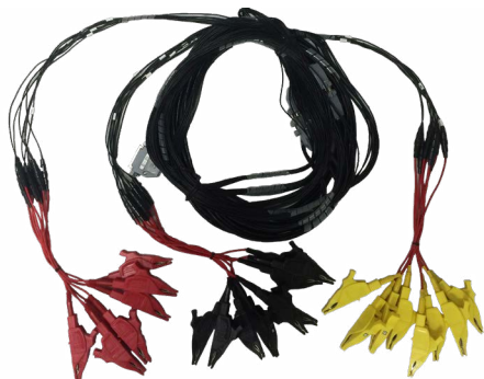
Cell Monitoring Harnesses

In addition to the base CC model, we offer (2) additional model packages that incorporate added features to suit the full range of our customer needs. These advanced models provide the standard CC features Plus Data Management Software, Per Cell Monitoring, LCD Screen, Data Storage, and Programmable Load Steps. See model chart on page 3 for details.