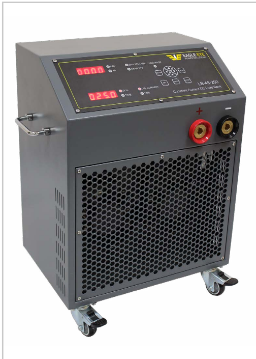
LB-Series CC Load Bank