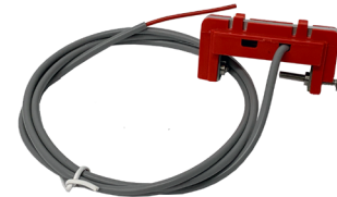
Clamp & Harness