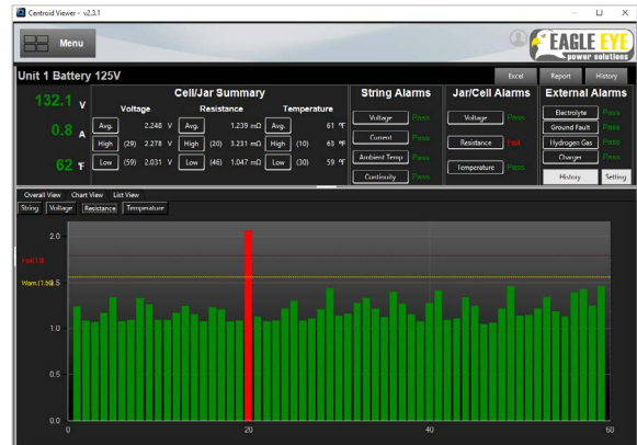
Centroid Snet 2