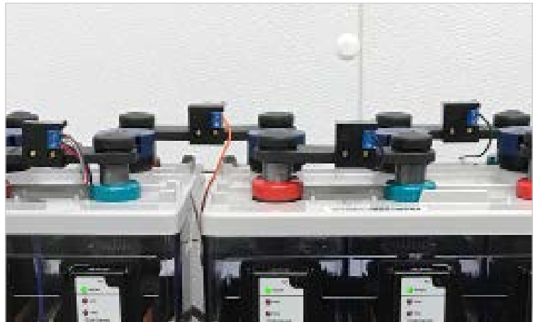
BQMS Battery Connection - C-Type Clamps