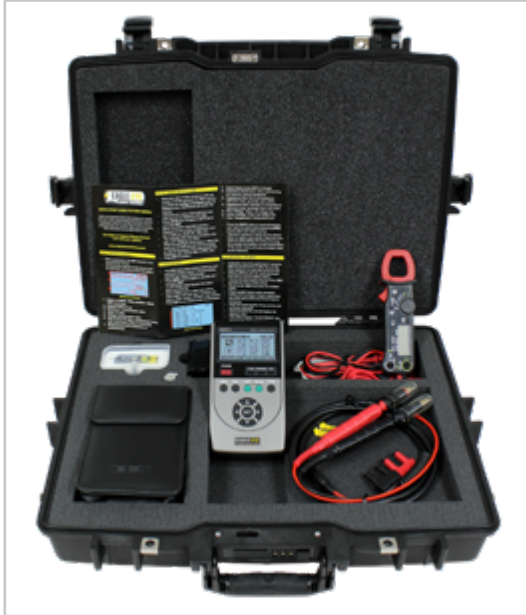
IBEX Ultra Kit