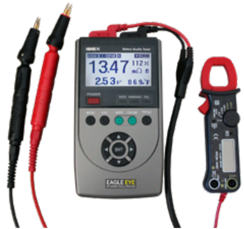
IBEX-Ultra with 4-Pin Test Leads and CT Clamp Meter