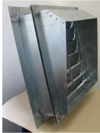
Louver set up for Supply Fan

A Control Box is provided to connect Power, Return, Signaling from the HGD Sensor, Dry Contact inputs to activate the Positive Airflow Shut Off, and Case Ground. This box may be factory relocated to either side, or the bottom of the unit.