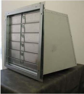
Louver set up for Exhaust Fan

If the unit is an Exhaust Fan the louvers must be turned to let air out. If the unit is a Supply Fan the louvers must be turned to let air into the room. It can be positioned either way. So, the installer must understand the airflow direction. Fan Units come from the factory with the fans mounted in the direction needed for proper airflow. Louvers used with Supply Fans have a spacer to provide room for louver movement. The spacer, louver and rain hood come from the factory as an assembly. It is ready for installation. The louver is the only installation difference.