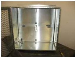
Positive shut off doors closed

To reset, Open the Positive Shut off System switch. Remove the front screen. Lift the doors up. Reset the latches. Then close the front screen.