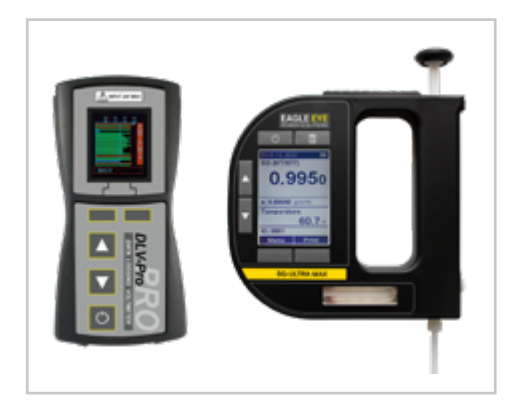
DLV-Pro Voltmeter & SG-Ultra Max Digital