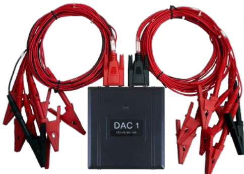
Data Acquisition Case (DAC)

Eagle Eye's SLB-Series Load Banks come with an optional DAC package allowing the voltage of EACH CELL to be wirelessly monitored and recorded during discharge. The DAC package allows the user to evaluate the health of each cell and replace only the cells that require replacement - saving time and money by significantly reducing labor hours and replacement costs.