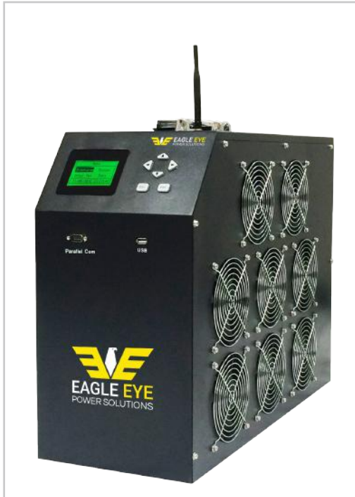
SLB-Series DC Load Bank