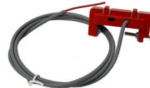
Clamp & Harness