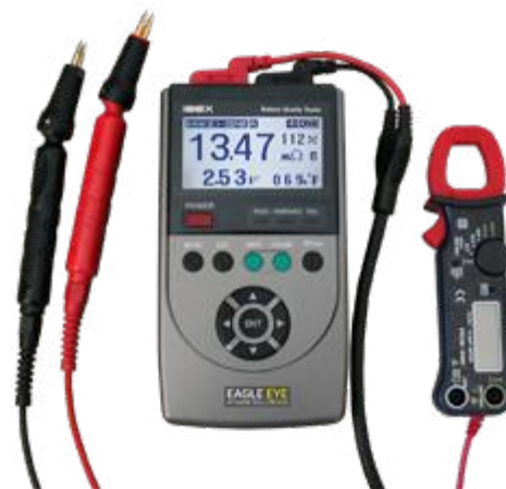
IBEX-Ultra with 4-Pin Test Leads and CT Clamp Meter