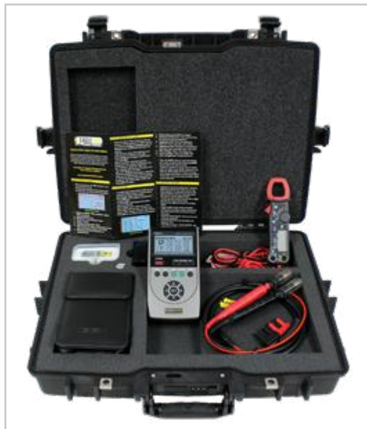
IBEX Ultra Kit