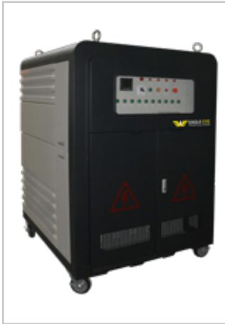
LB-Series AC Load Bank