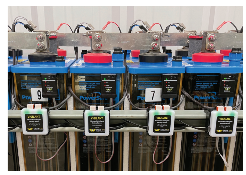
Vigilant Components Installed