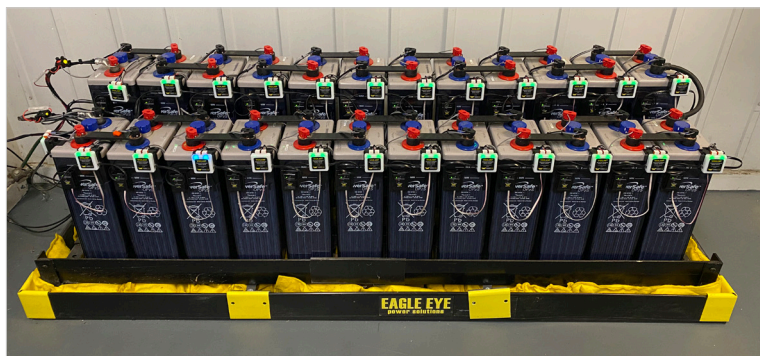
VIGILANT Installation to Flooded (VLA) Cells